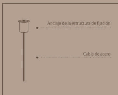
Colgantes tensor de anclaje a losa